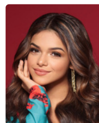
Bella Bravo Summer Intern