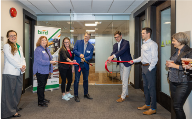
TOP: Kelowna Film Studios Grand Opening BOTTOM: Ribbon Cutting at Grand Opening of Bird Kelowna