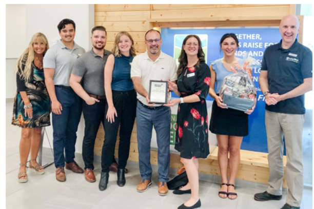
TOP: Ribbon cutting at grand opening of Brain Trust Canada