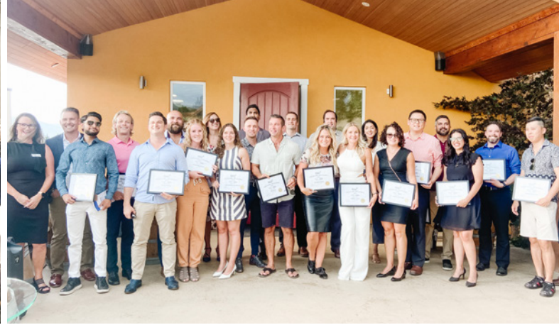
LEFT: Commerce ConneX at the Rotary Centre for the Arts; MIDDLE: Speaker Series Luncheon; RIGHT: Top Forty under 40