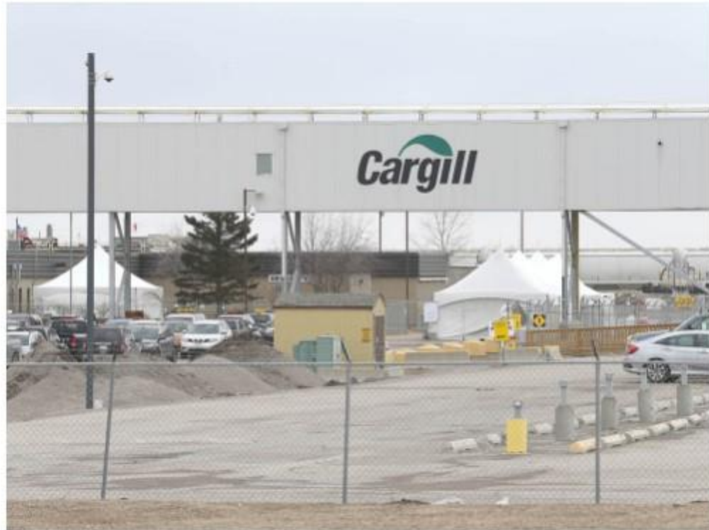
The Cargill plant north of High River, AB, south of Calgary is shown on Friday, April 17, 2020.