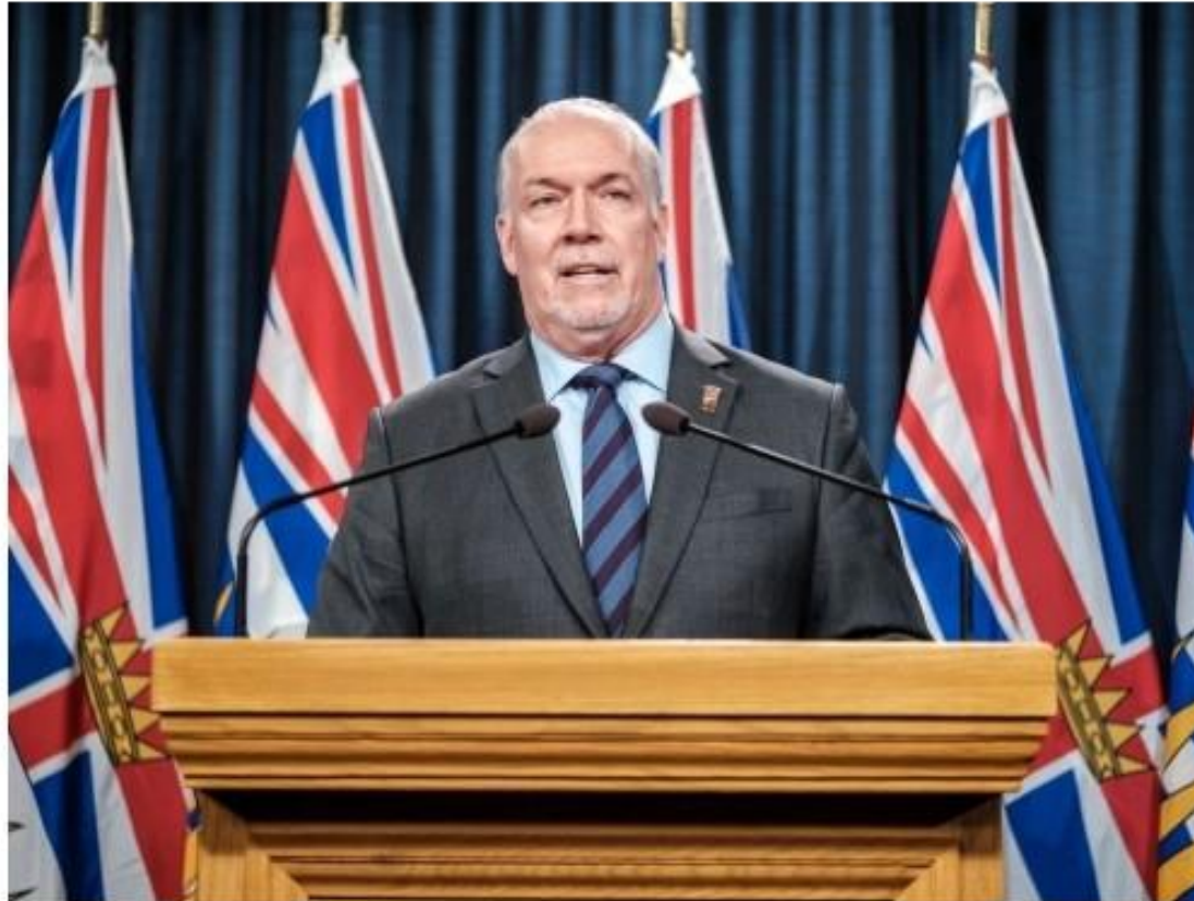
Premier John Horgan is set to speak on Wednesday afternoon.