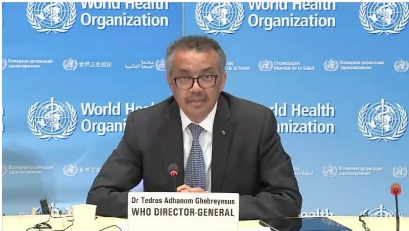
WHO: Do Not Question Whether There Will Be a Second Wave of Virus Infections